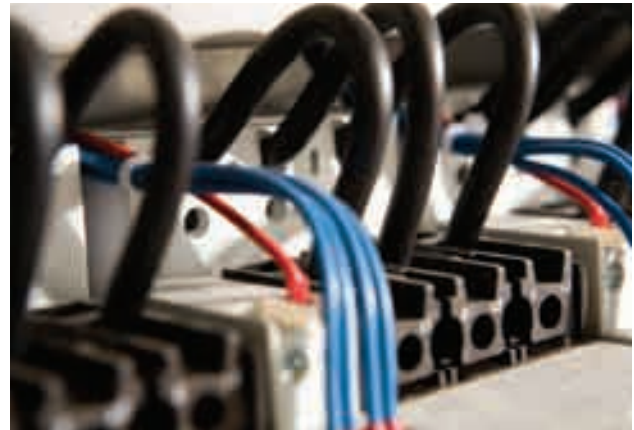
Energy losses affecting efficiency are a function of amperage (the "I" in I 2 R).

require daily maintenance and adjustments. The fact that medium voltage technology requires fewer wires and connections simplifies inspection time, further decreasing maintenance-associated costs.