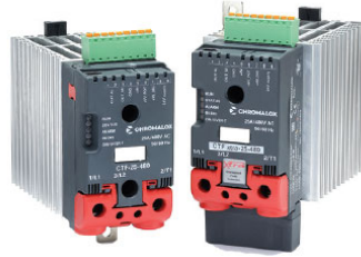
DISCRETE TEMPERATURE & POWER CONTROLS