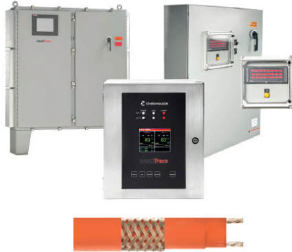
HEAT TRACE PANELS