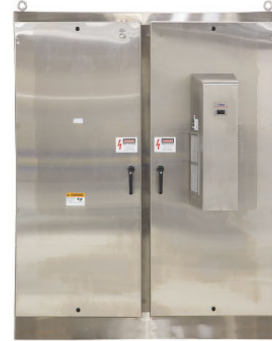
PROCESS HEATING CONTROL SYSTEMS