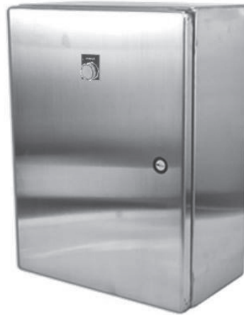
Remote Sensor Panel