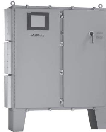
ITLS/ITAS IntelliTrace Heat Trace Control System