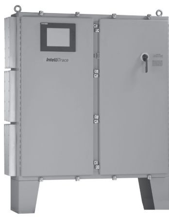
ITLS/ITAS IntelliTrace Heat Trace Control System