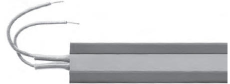
Type L2 with Lead Wires Standard