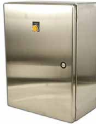
Remote Sensor Panel