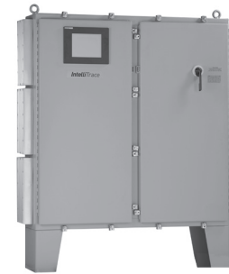
ITLS/ITAS IntelliTrace Heat Trace Control System