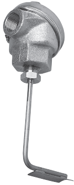
RBF185M Heat Trace Sensor Pipe Mounted with Connection Head