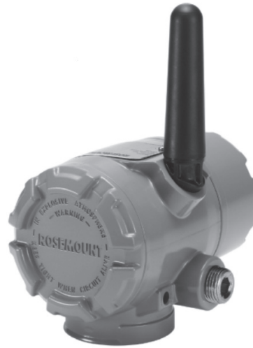
Wireless Temperature Transmitter