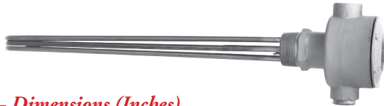
E2 — Dimensions (Inches)