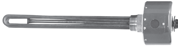
E1 — Dimensions (Inches)