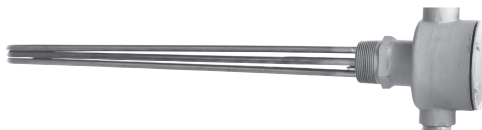
E2 — Dimensions (Inches)