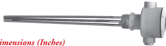
E2 — Dimensions (Inches)