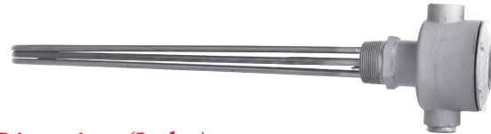
E2 — Dimensions (Inches)